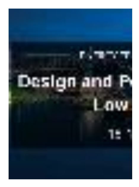
16-22 Aug 2023 In-Person Course